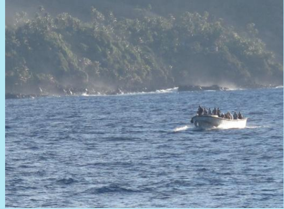
The “Fidelio” observed from the longboat, and the longboat observed from the ship, as we approach.