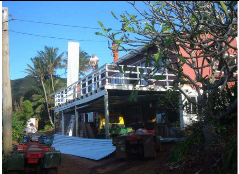
LOOK AT THE BEAUTIFUL FRANGIPANI TREE TO THE SIDE OF THEIR HOUSE