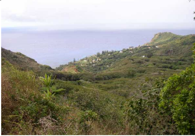
Adamstown in the distance